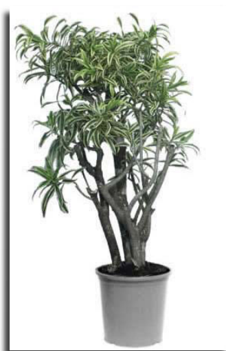
Eleven Pleomele Reflexa – Song of India Size – 1.5m

Conditions – happy in normal office light