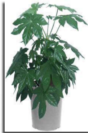
Sixteen Fatsia Japonica Size – 1.2m