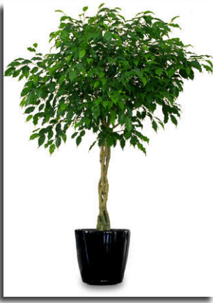
Twenty seven Ficus benjamina braided stem