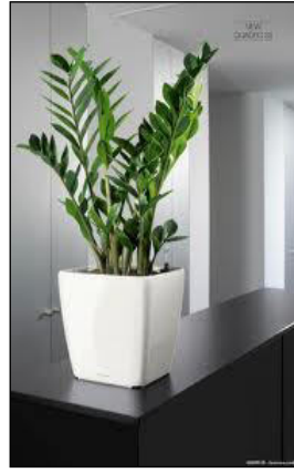
Twenty eight Zamioculcas Size 40cm + Conditions – happy in normal office light