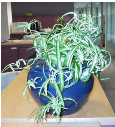
spider plant Removes benzene, formaldehyde, carbon monoxide and xylene