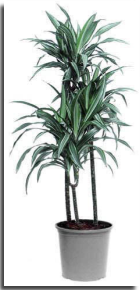
Thirteen Dracaena Ulysses