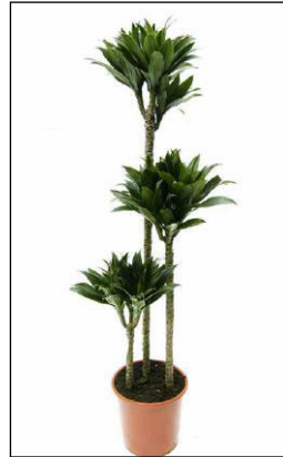
Thirty Dracaena compacta Size 1.5m