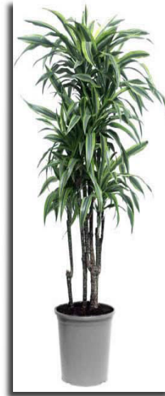
Eight Character Dracaena Lemon & Lime

Conditions – happy in normal office light or low light areas