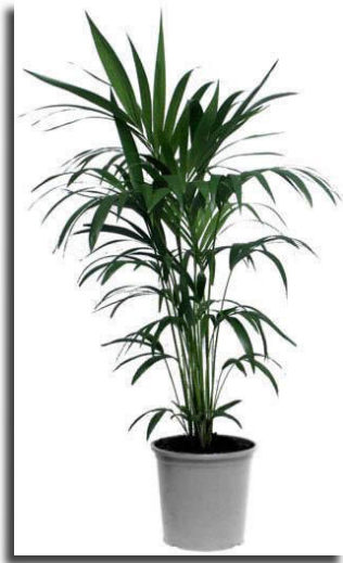
Fifteen Kentia Palm Size – 1.6m Conditions – happy in normal office light or low light areas

Conditions – happy in normal office light or low light areas