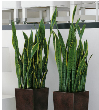
Sansevieria - this plant is one of the best for filtering out formaldehyde