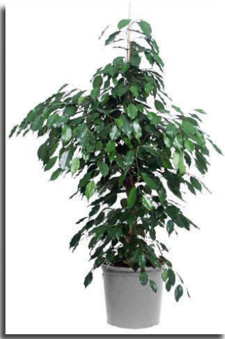
Nineteen Ficus Benjamina Size – 1.5m Conditions – happy in normal office light