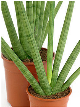
Twenty nine Sansevieria cylindri- ca skyline.