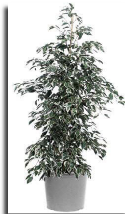
Twenty two Ficus Starlight Size 1.5m Conditions happy in normal light.