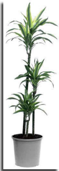
Seven Dracaena Lemon & Lime