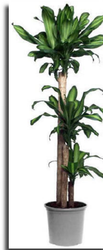
Ten Dracaena Massangeana Size – 1.5m

Conditions – happy in normal office light or low light areas