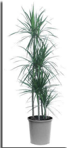
Nine Dracaena Marginata Size – 1.5m

Conditions – happy in normal office light or low light areas