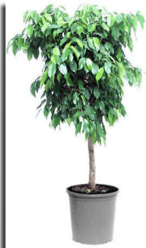
Twenty five Ficus Benjamina Ballhead premium Size – 1.8m Conditions – happy in normal office light