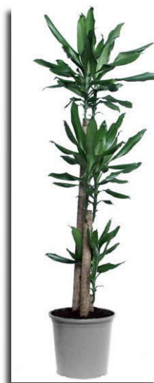
Twelve Dracaena Steudneri Size – 1.5m

Conditions – happy in normal office light