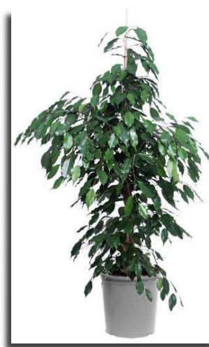
Twenty Ficus Benhamina regular Size – 1.8m Conditions – happy in normal office light