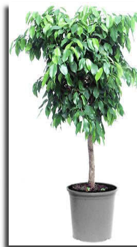
Twenty Six Ficus Benjamina Ballhead regular Size – 1.5m Conditions – happy in normal office light