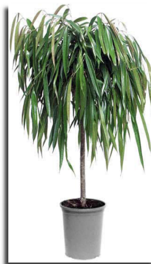
Eighteen Ficus Ali Ballhead Size – 1.8m

Conditions – happy in normal office light