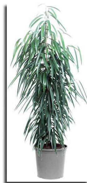
Seventeen Ficus Ali Size – 1.5m

Conditions – happy in normal office light