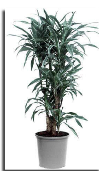
Forteen Character Dracaena Warneckii Size – 1.5m

Conditions – happy in normal office light or low light areas