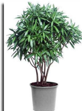
Twenty four Pleomele – Song of Jamaica Size - 1.5m Conditions= happy in normal office light or low light areas