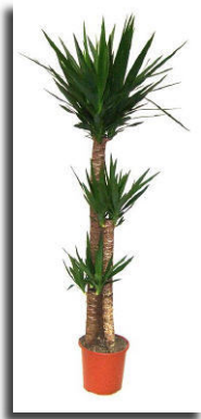
Twenty one Yucca Size 1.5m Conditions happy in normal office light