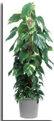
Twenty three Scindapsis on a Moss pole Size – 1.5m Conditions – happy in normal office light